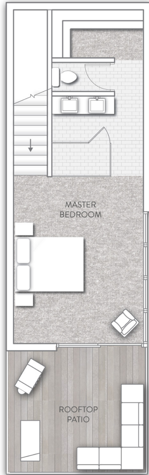
UNIT C1 - LEVEL 3